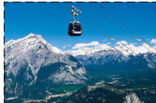
Banff Gondola Ride

After breakfast, morning visit the Jasper National Park passing through Columbia Icefield and take the snocoach tour on Ice field – The highlight in Canadian Rockies. (SNOCOACH TOUR operates from APR 18 – OCT 19, 2016 only). The Jasper National Park was established in 1907 and is the largest national park in the Canadian Rockies with 10,879 square kilometers of mountain wilderness. It contains a superb back country trail system as well as the world famous Columbia Ice field, one of the only Ice field in the world accessible by the road.