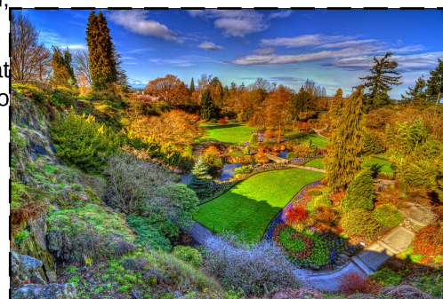
Queen Elizabeth Park