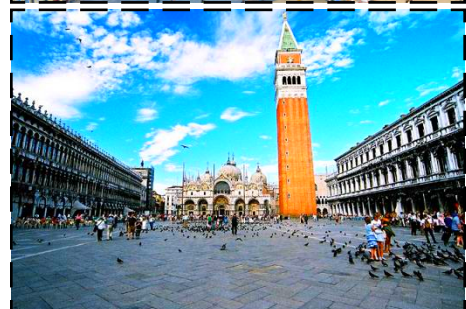
Piazza San Marco

Hot buffet breakfast in hotel. This morning begin our drive to Venice Mestre, the center and the most populated urban area of the Mainland of Venice, Italy . Lunch en-route at Chinese restaurant. Upon arrival, proceed to Tronchetto pier for private boat to Piazza San Marco for half day sightseeing tour on foot with visit to glass factory including display of glass blowing, view of the bridge of sighs. Dinner provided at local restaurant in San Marco Area. Then return to pier and check in at Novotel Venezia Mestre or similar class.