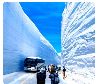
Tateyama Kurobe Alpine Route