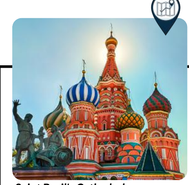
Saint Basil's Cathedral

Hot buffet breakfast at the hotel. Full day sightseeing tour. Explore St. Petersburg in a guided tour includes entrance to the Peter and Paul fortress (Includes Cathedral), View of the Bronze Horseman Statue (Statue of Peter and Great). Entrance to the Hermitage Museum (also known as Winter Palace) – A museum of art and culture in St. Petersburg. One of the largest and oldest museum of the Worlds. It was founded in 1764 by Catherine the great and open to the public since 1852.