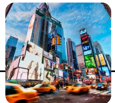
New York's Time Square