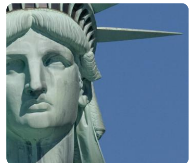
Statue of Liberty